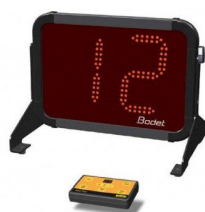
B3312SF – Time of possession 12s for 3x3 goal