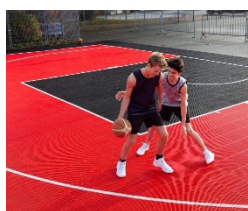
B3305 – Basketball court 3x3 in tiles