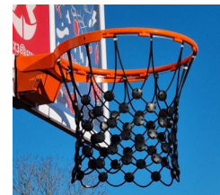
B3126 – Anti-vandalism basketball net