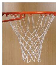
B3124 – Basketball Nets Competition Nylon 4.5 mm